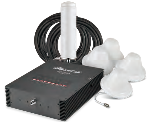
Shown: Force5 2.0 Omni / 4 Dome Kit SC-PolyO2-72-OD4-Kit