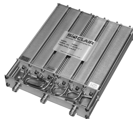
BNC Connector option shown.