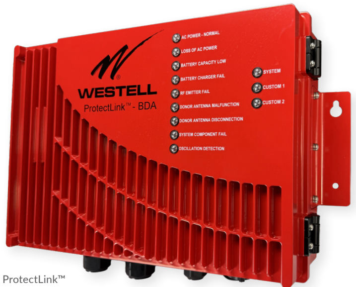
ProtectLink ™ CS45-727-827-A0