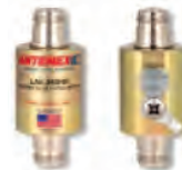
Lightning Arrestor LABH350NN (Sold Separately)