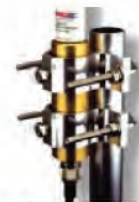
FM2 Mounting Kit (Sold separately)

Laird warrants to the original end user customer of its products that its products are free from defects in material and workmanship. Subject to conditions and limitations Laird will, at its option, either repair or replace any part of its products that prove defective by reason of improper workmanship or materials. This limited warranty is in force for the useful lifetime of the original end product into which the Laird product is installed. Useful lifetime of the original end product may vary but is not to exceed five (5) years from the original date of the end product purchase.