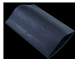
1pcs shrink tube out of pack of 10

RFS Weatherproofing Heat Shrink Tube pack are designed to be used with RFS Field-installable OMNI FIT connectors that works on RFS DragonSkin™ 2HB12-50JPLR cable to gain outstanding additional weatherproofing feature in addition to RFS OMNI FIT Connectors' own weatherproofing performance. Each pack contains 10pcs individual tube which could work specifically together with RFS field-installable OMNI FIT™ C02 & C03, D01 & E01 high performance connectors to improved network performance, reduces the number of dropped calls and avoids revenue losses.